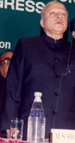
M. S. SWAMINATHAN