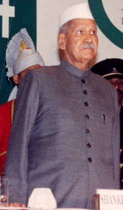
SHANKER DAYAL SHARMA