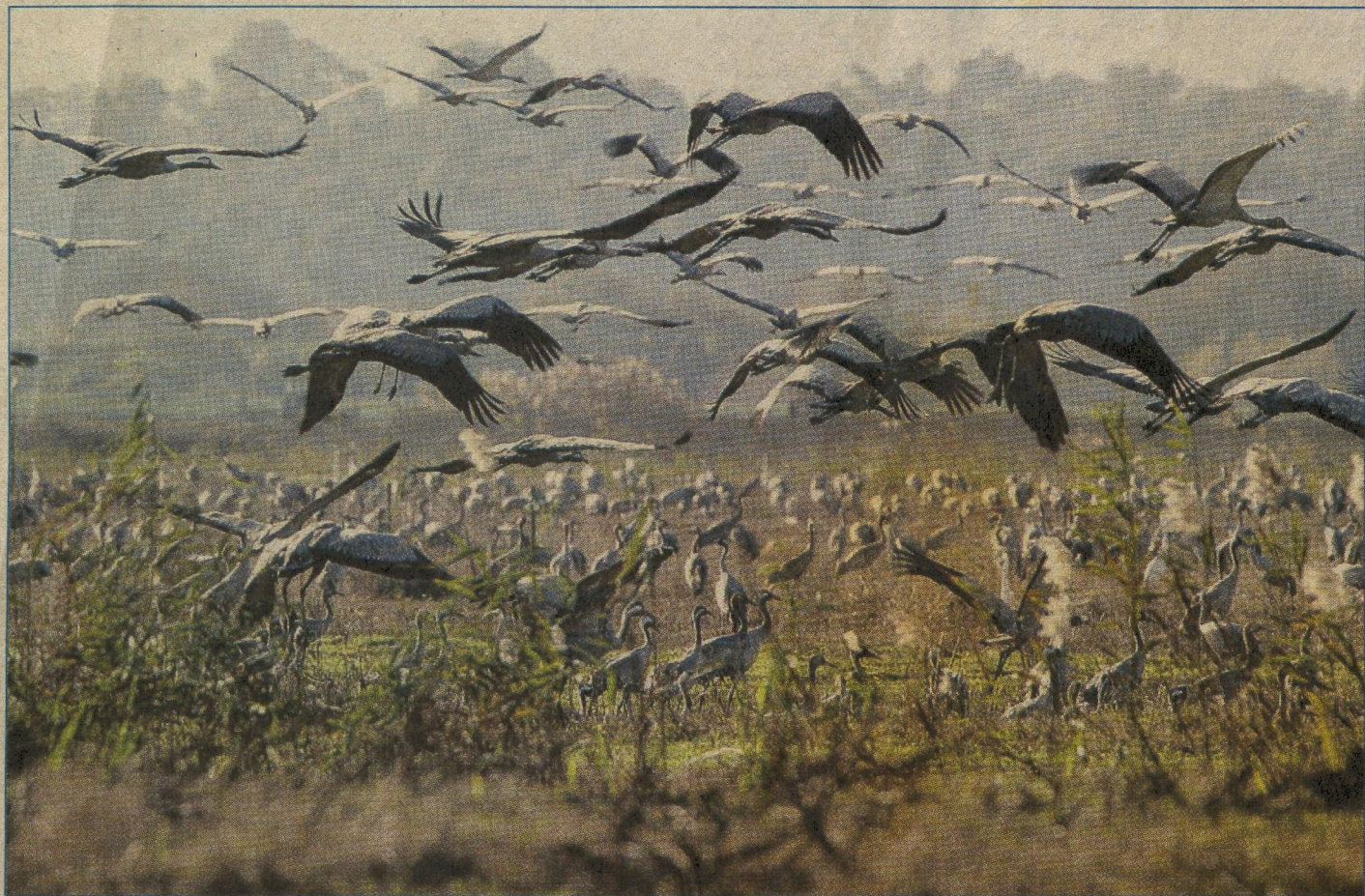
LUNCH STOP-OVER: Cranes gather in Hula Valley, north Israel, where three tonnes of corn are spread out every day to feed various migrating birds. Some 30,000 cranes, about 20 per cent of the world's population, migrate from Russia between October and November. While the majority fly on to Africa, the 10,000 or so that stay behind are fed on corn, with farmers, Israeli nature protection agencies and some international sponsors sharing the cost.

Local villagers — whose homes are encroaching on the wetland and who hunted the birds until the early 1990s — nevertheless feel sorry for them and are worried about their dwindling numbers. "We are emotionally attached to these birds, who have been our guests for centuries," said Inder Ram