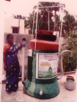
Portable Biogas Unit - An Alternate for LPG