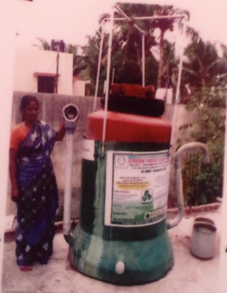
Portable Biogas Unit - An Alternate for LPG