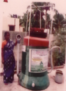
Portable Biogas Unit - An Alternate for LPG