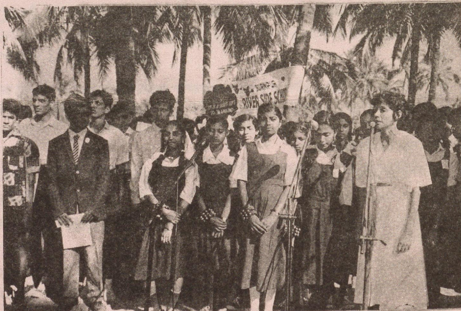
Goa- We'll Keep It Green !... ( A Chorus)