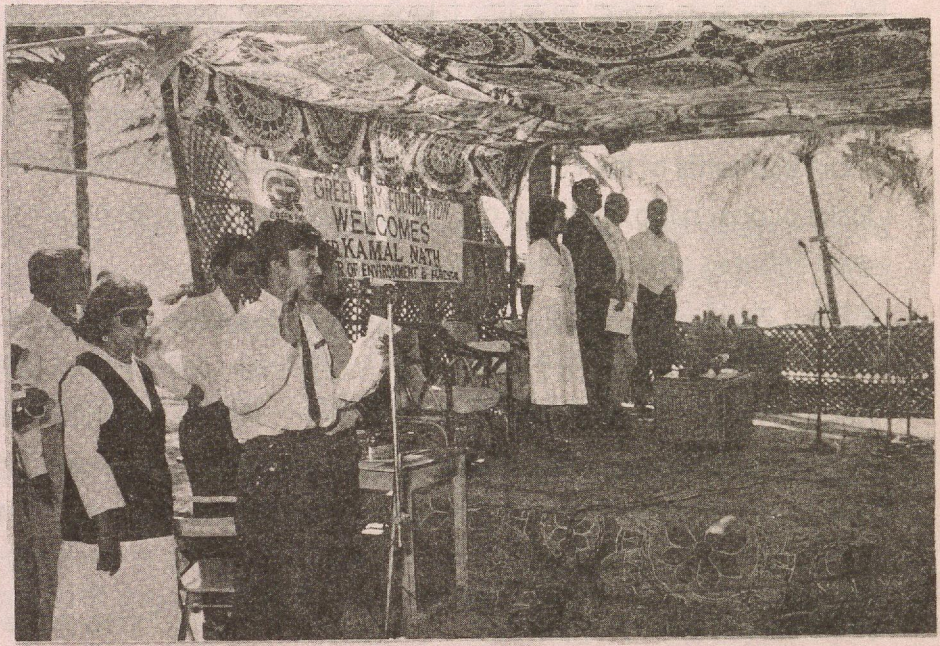
Eco-children taking Pledge

I pledge to be aware of my immediate surroundings at all times, and to actively participate in all environmental conservation efforts, I shall always keep the interests of the people above my own, and to only invest in development that is sustainable; I shall never forget that the Earth is our only way of survival, and I shall love, cherish and preserve it for the benefit of mankind.