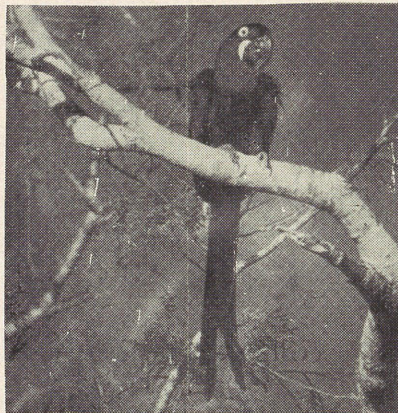
Hyacinth Macaw, one of the world's most threatened parrots

The ecological requirements of parrots vary enormously. Many parrot species are adaptable, and some birds that have been released, or have escaped from the vast populations held in captivity, have become naturalised. For example, in the United States at least 27 species of parrot have such feral populations. Other species have proliferated