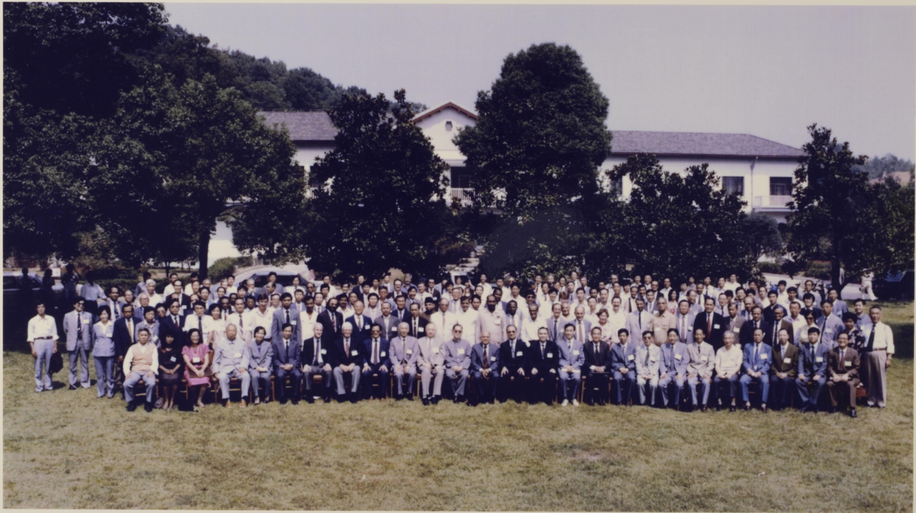
INTERNATIONAL RICE RESEARCH CONFERENCE, 21-25 Sep, 1987 HANGZHOU, CHINA