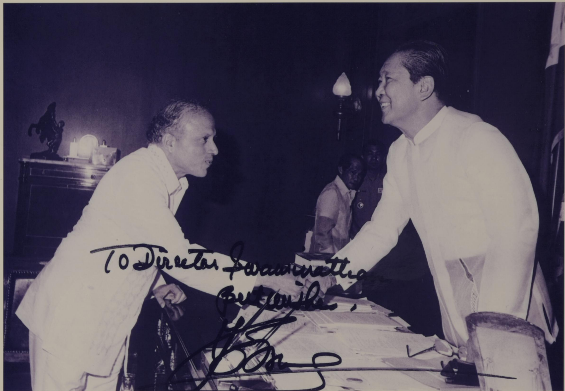
... with President Marcos