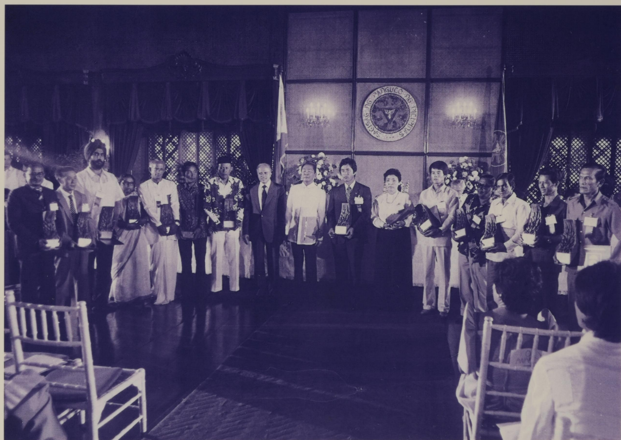
Awarding ceremonies at Malacanang Palace - outstanding farmers of the World, June 5, 1985