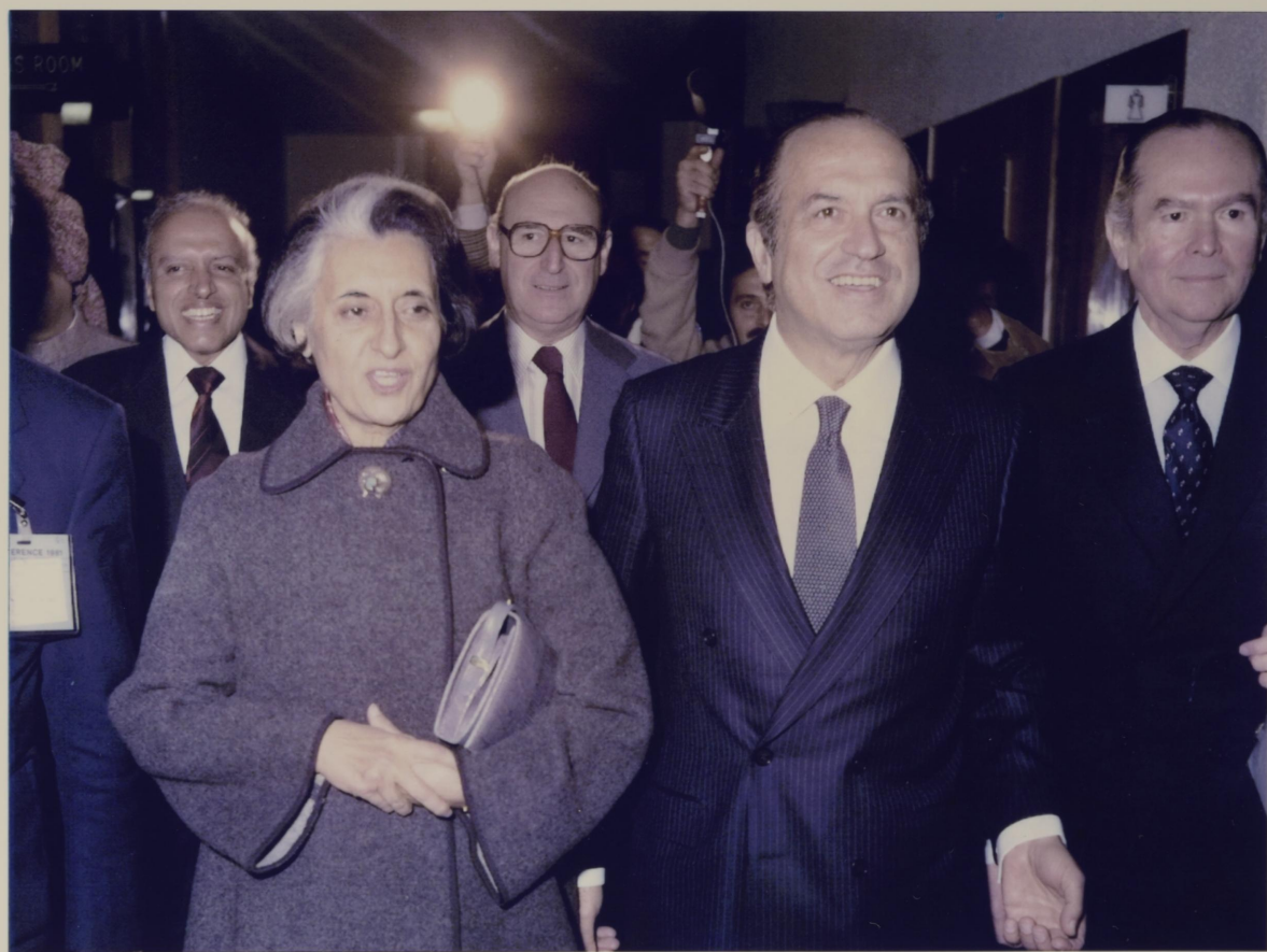
... at the McDougall lecture, Rome, Nov 9, 1981