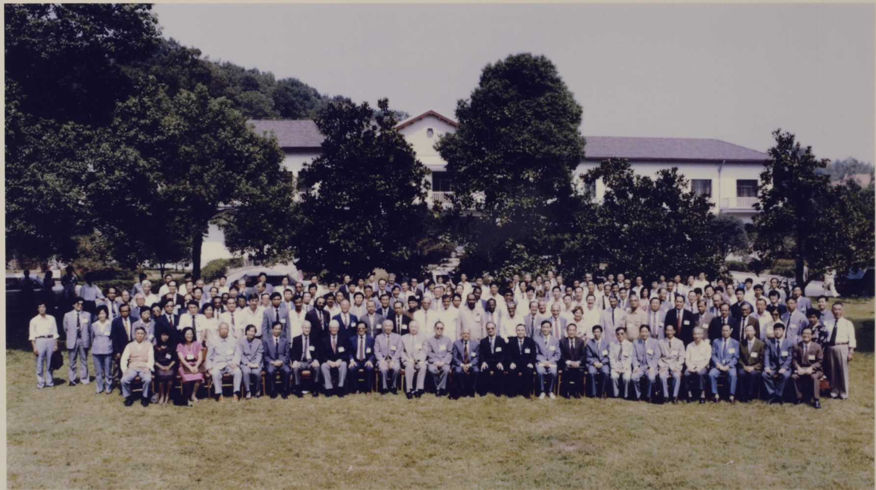
1987 International Rice Research Conference 21-25 Sep 1987, Hangzhou, China