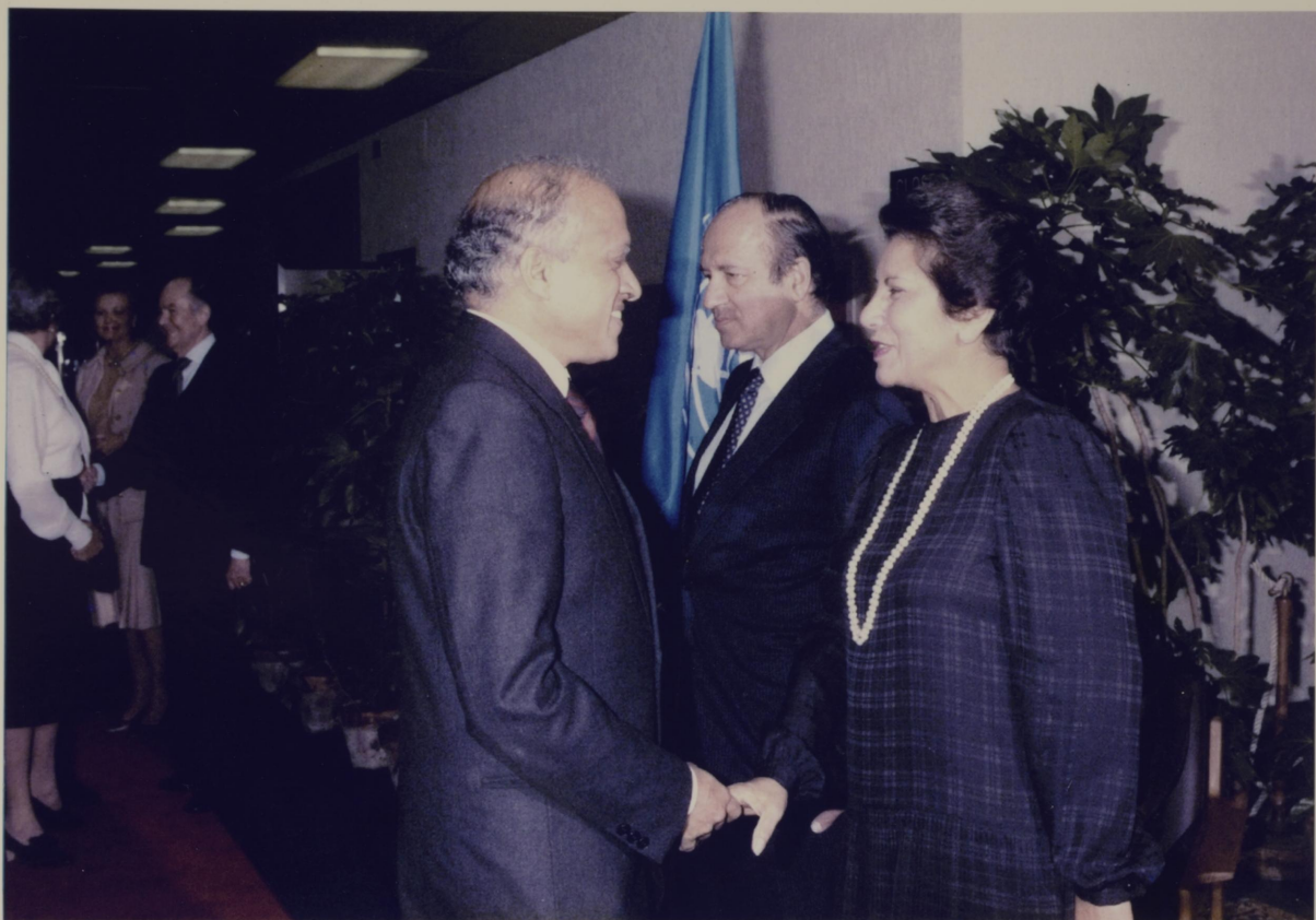
... with FAO Director Gen. and his wife