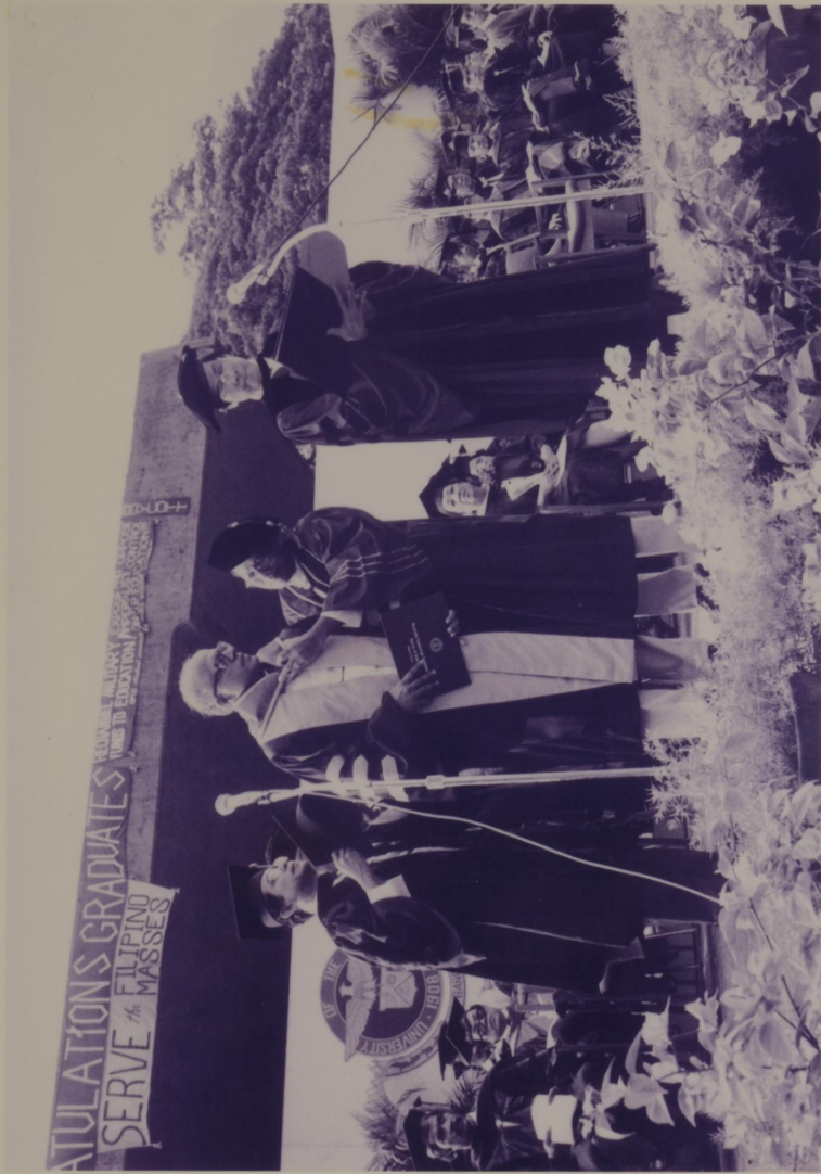
..awarding of honorary degree by the University of the Philippines, 1984