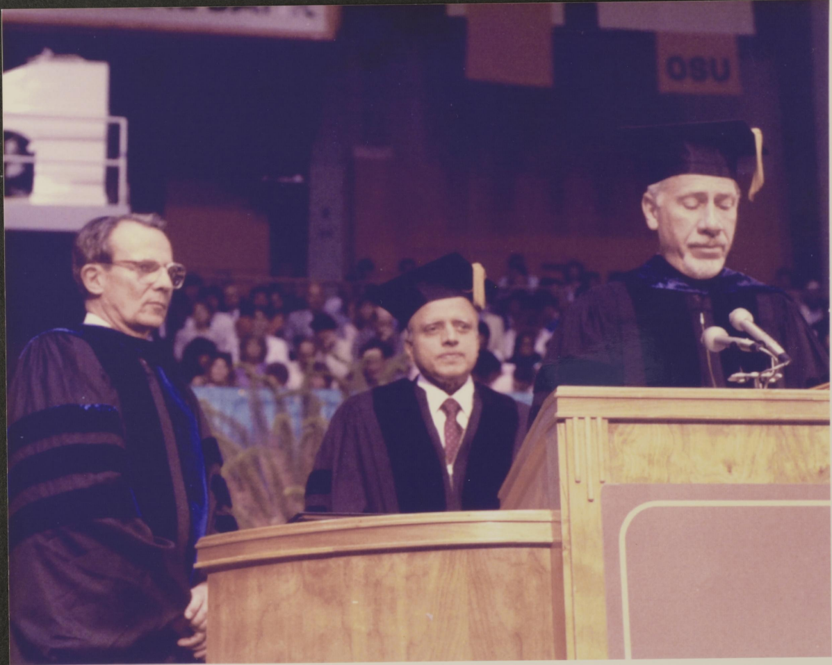
OREGON STATE UNIVERSITY Commencement June 5th, 1988