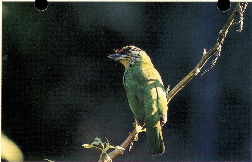
นกโพระดกคางเหลือง Golden-throated Barbet Megalaima franklinii