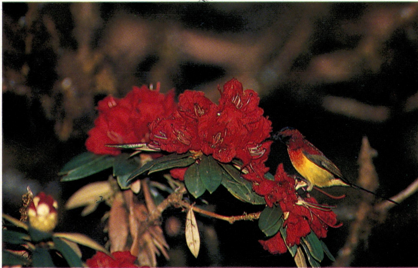
นกกีป्लीหางยาวคอสีฟ้า Gould's Sunbird Aethopyga gouldiae