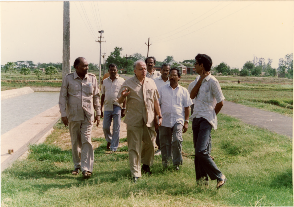
WALKING ON THE BUND OF RICE-CUM-FISH TANK