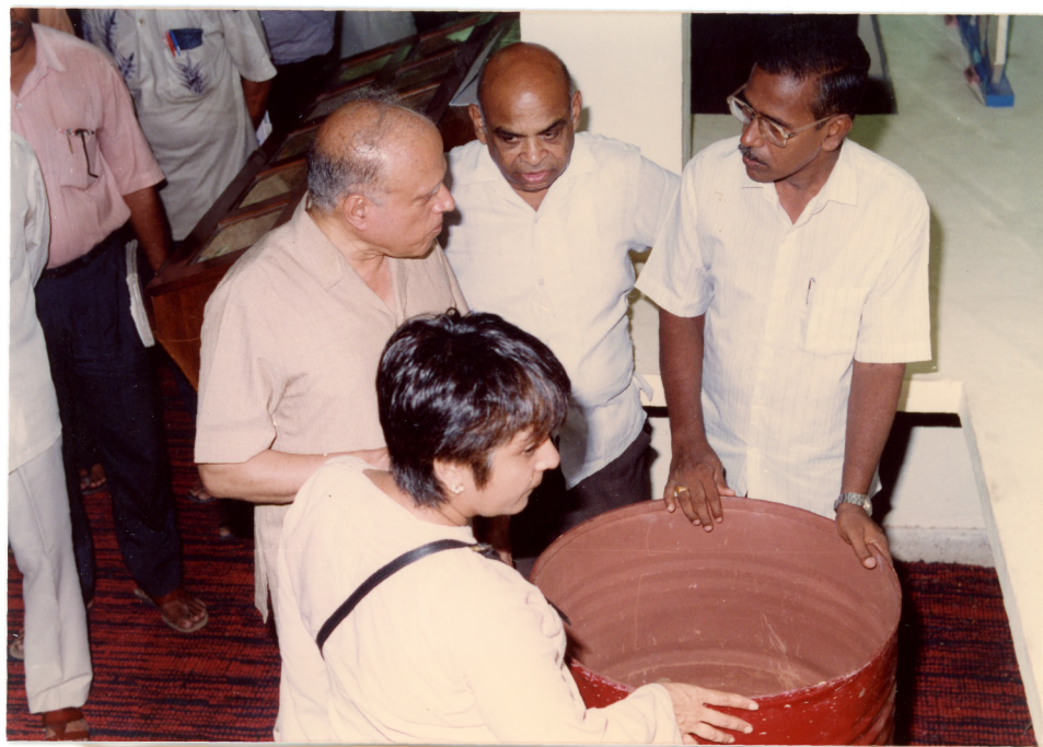
DISCUSSING ABOUT PARBOILING UNIT OF RICE