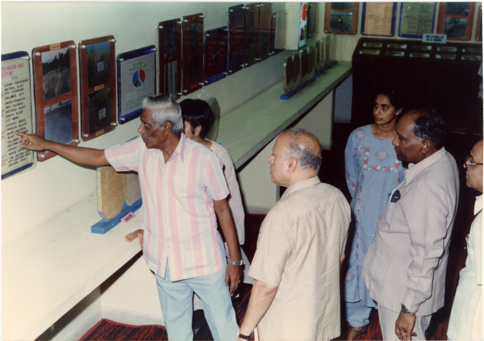
VISITING THE DISPLAY HALL