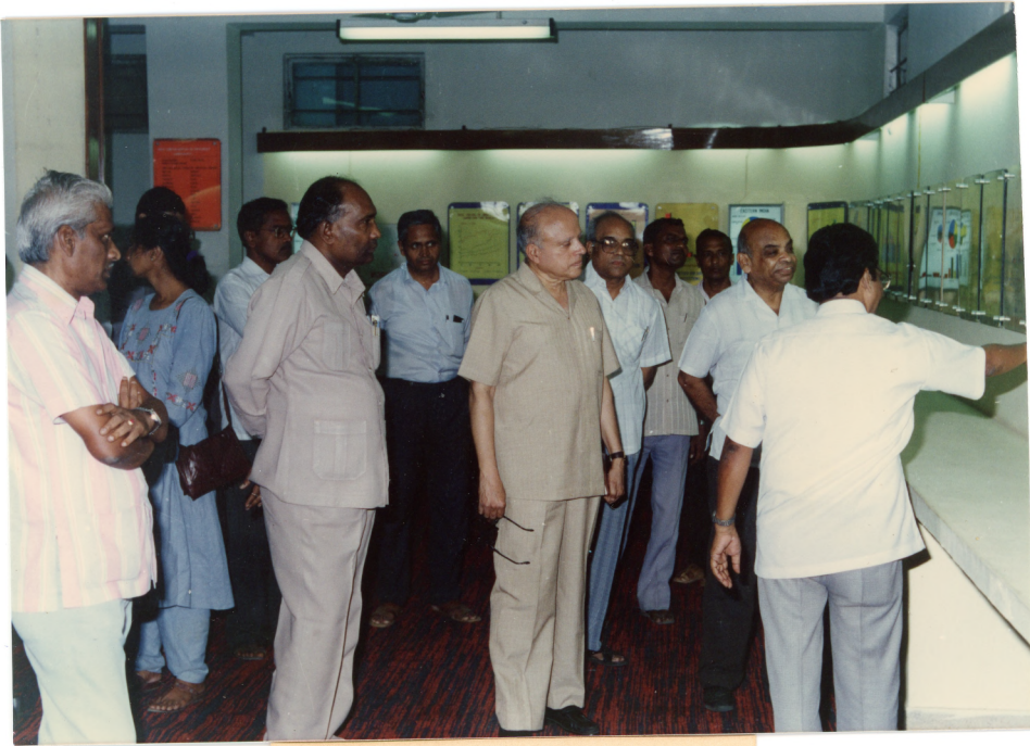
VISITING THE DISPLAY HALL