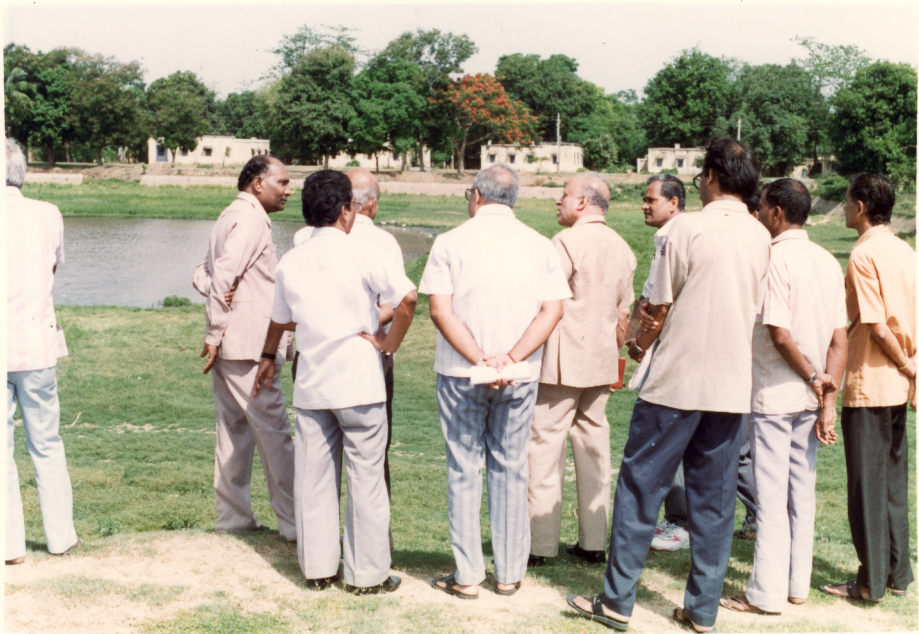
GROUP PHOTO ON THE BUND OF DEEP WATER RICE SYSTEM