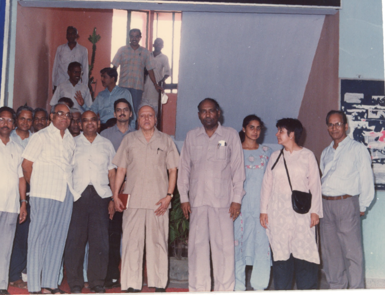
GROUP PHOTO AT THE ENTRANCE OF THE BUILDING