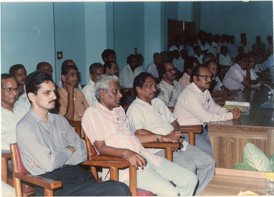
A SECTION OF AUDIENCE