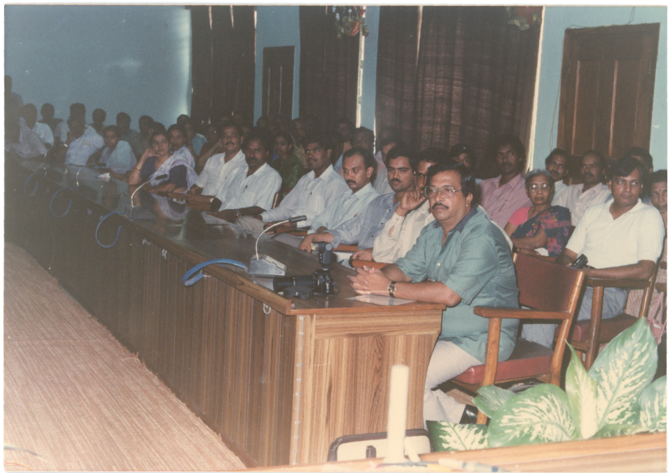
A SECTION OF AUDIENCE