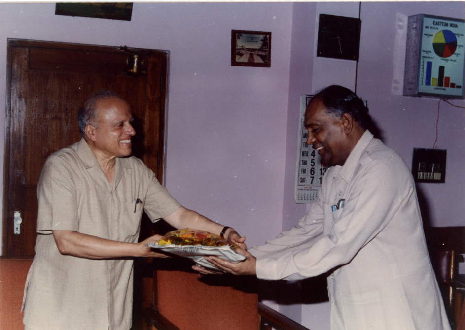
DIRECTOR PRESENTING BOUQUET