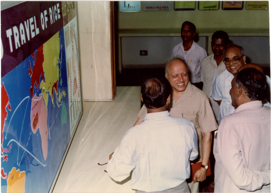
LOOKING AT ORIGIN AND TRAVEL OF RICE