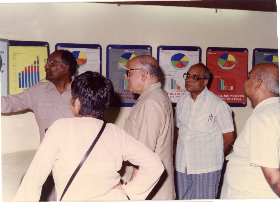
VISITING THE DISPLAY HALL