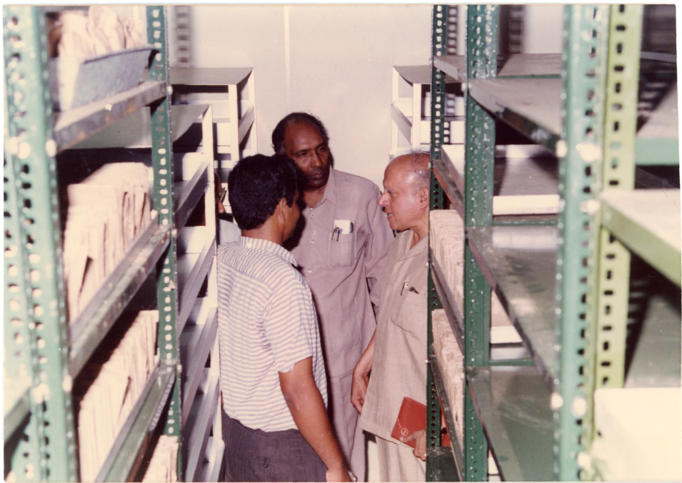
INSIDE THE GENE BANK