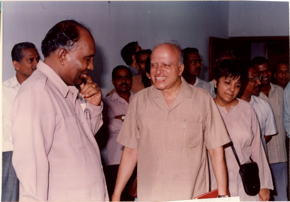
DISCUSSING WITH THE DIRECTOR