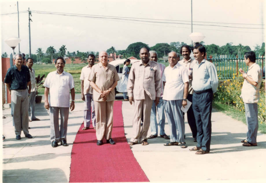
GROUP PHOTO BEFORE ENTERING THE BUILDING