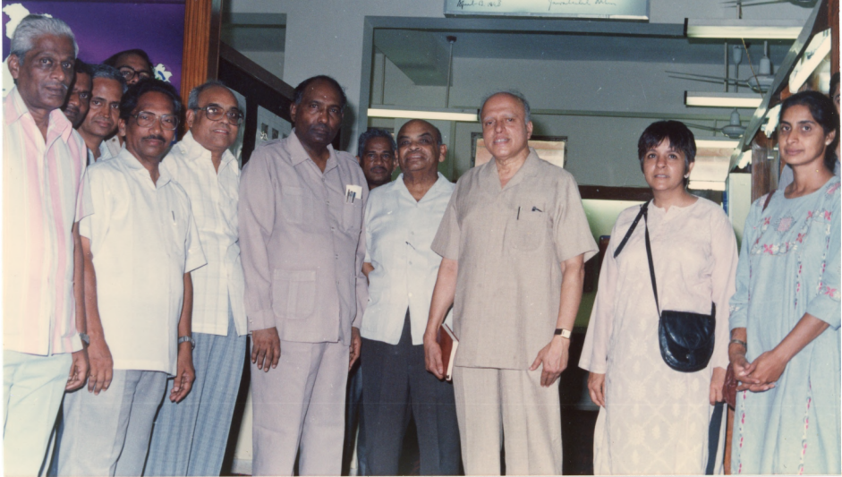
GROUP PHOTO IN DISPLAY HALL