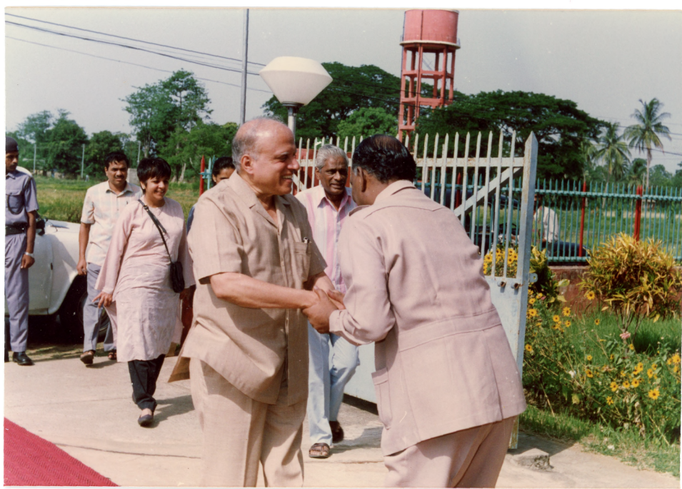
BEING RECEIVED BY THE DIRECTOR