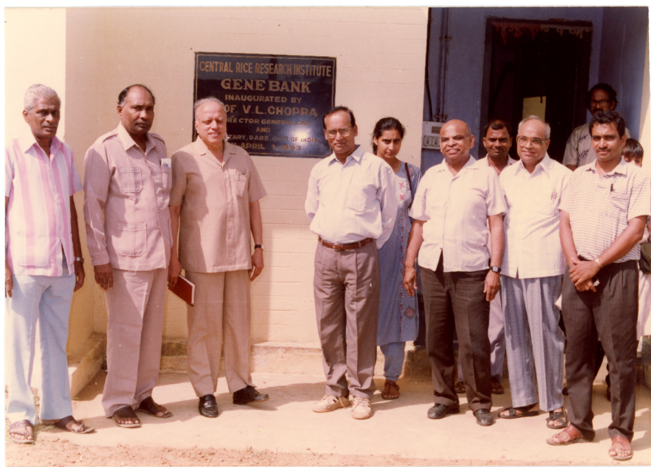
GROUP PHOTO AT GENE BANK