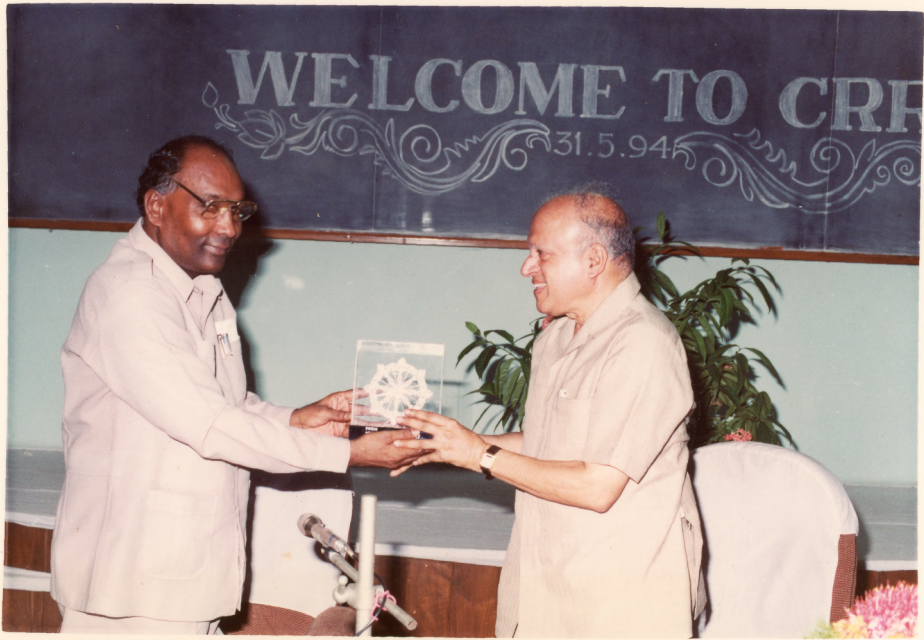
RECEIVING MEMENTO FROM THE DIRECTOR