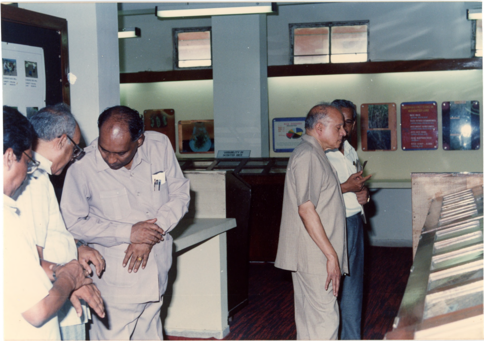
VISITING THE DISPLAY HALL