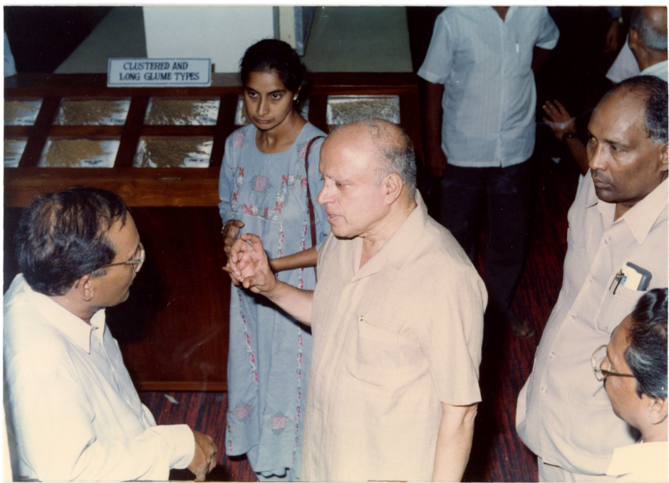
VISITING THE DISPLAY HALL