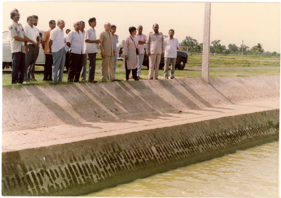
VISITING RICE-CUM-FISH TANK