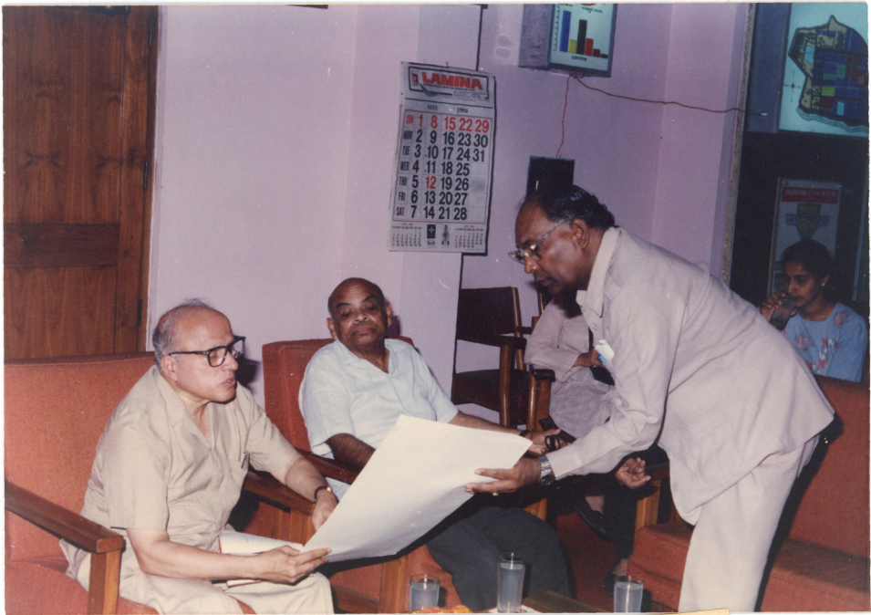
DIRECTOR SHOWING GRAPH ON DEMONSTRATIONS