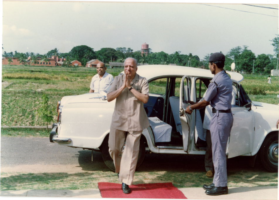
ARRIVING AT THE INSTITUTE