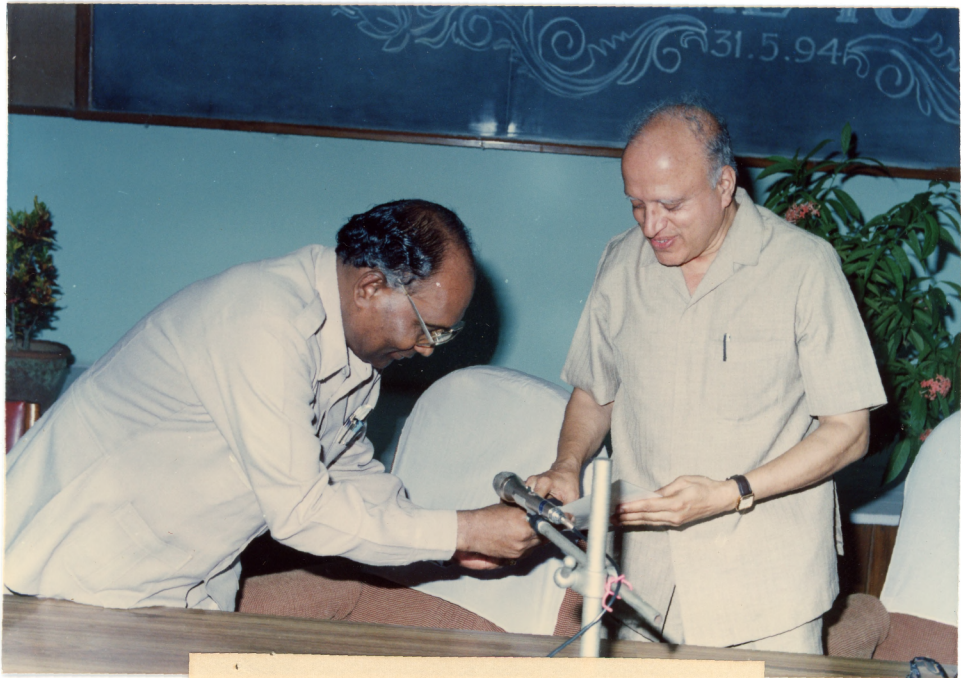
RECEIVING CITATION FROM DIRECTOR