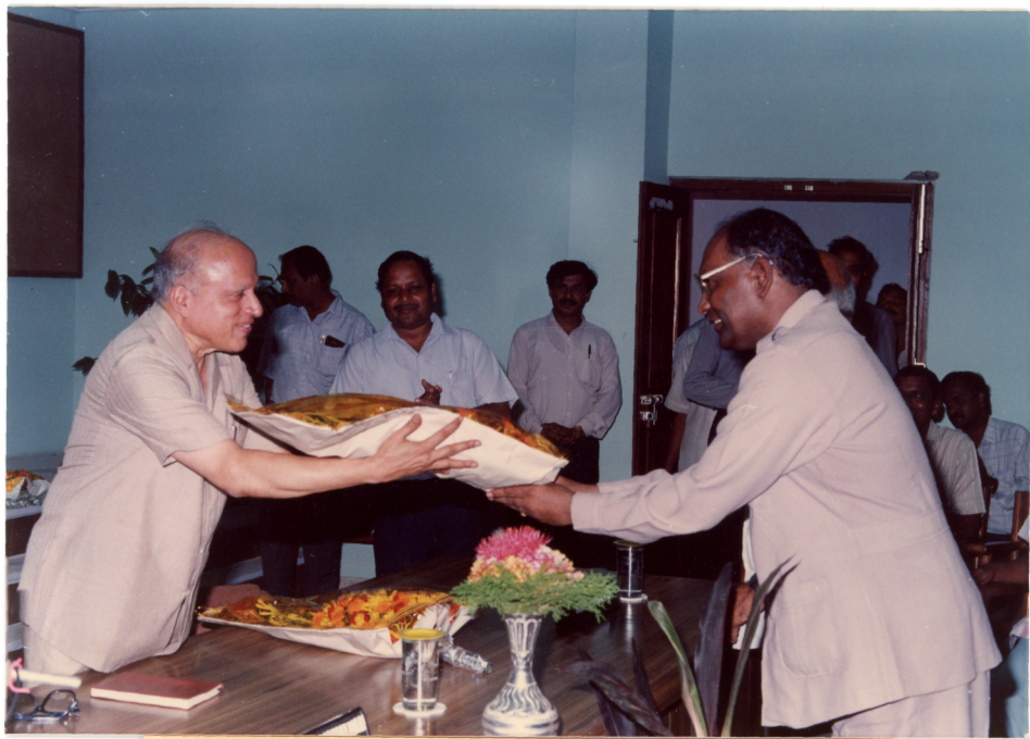
RECEIVING BOUQUET FROM PRESIDENT, ORYZA