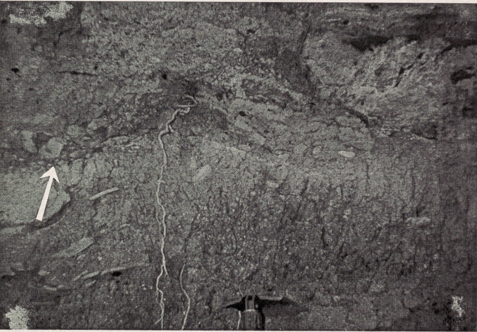
Figure 10 9 (Rajendran and Rajendran)