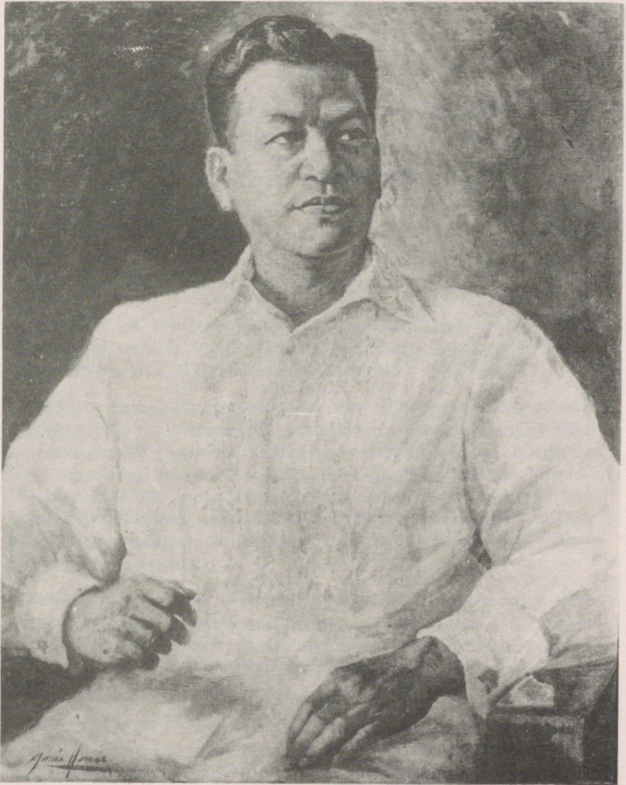
RAMON MAGSAYSAY 1907 — 1957

President of the Republic of the Philippines December 30, 1953 — March 17, 1957