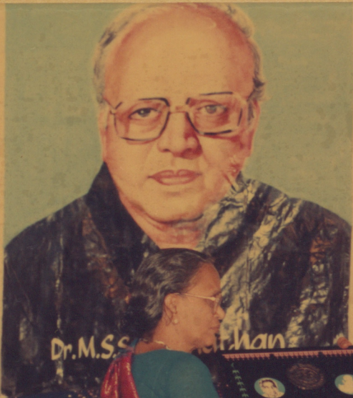
Dr. M.S. Swaminathan