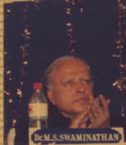
Dr. M.S. SWAMINATHAN