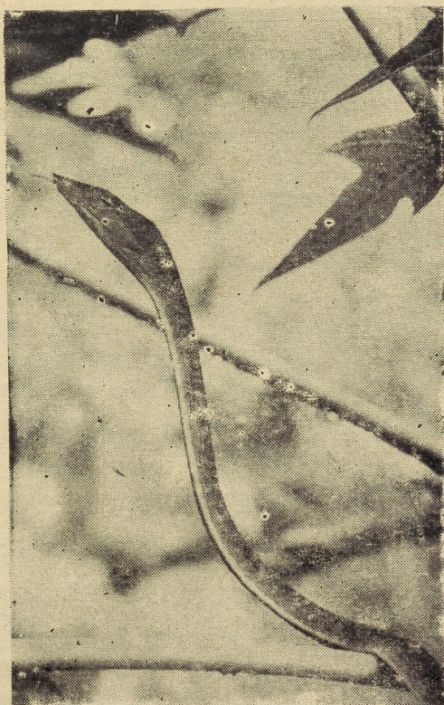
The Vine Snake feeds on small frogs and mice

abundance of rats and mice that generally proliferate in and around chicken houses. In Burma and Thailand it was once very common for the sugar factories and granaries to have their own resident pythons which lazily guarded the stored grain and sugar and eliminated the rodents more safely and effectively than any traps or poisons yet devised by man.