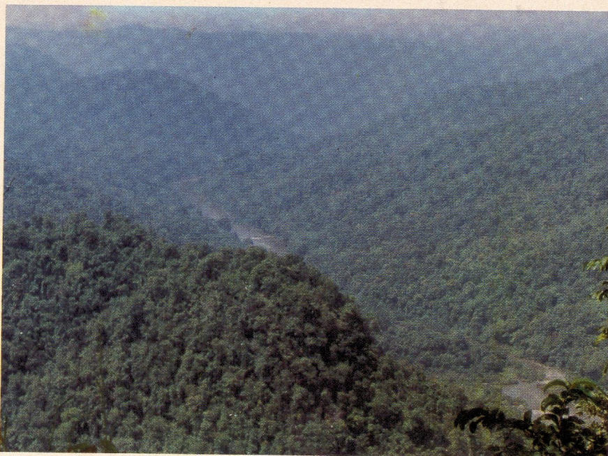
The unique Western Ghats' eco-systems, site of ODA's largest-ever forestry project.

The ODA's forestry projects in India will adopt an approach known as 'Joint Forest Planning and Management' (JFPM). This approach involves forestry management through collaboration between government and forest users. Over the years, demands on forests and forest products have greatly expanded, both as a result of industrial development and because of population growth. The JFPM approach involves devising plans for forestry protection and development on the basis of consultations with local populations. The plans should provide for their needs whilst at the same time protecting the forest areas which are managed by the