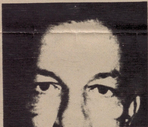
Baggy Eyelids - Before