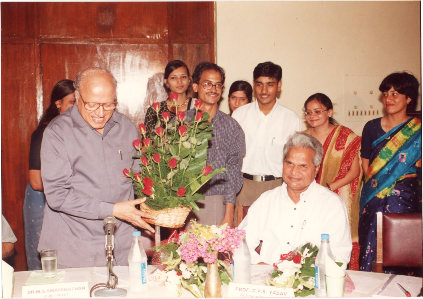
DR. M.S. SWAMINATHAN CHIEF GUEST