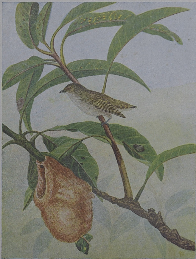
PIPRISOMA AGILE AGILE Tickell The Indian Thick-billed Flower-pecker About \frac{1}{2} Nat. size