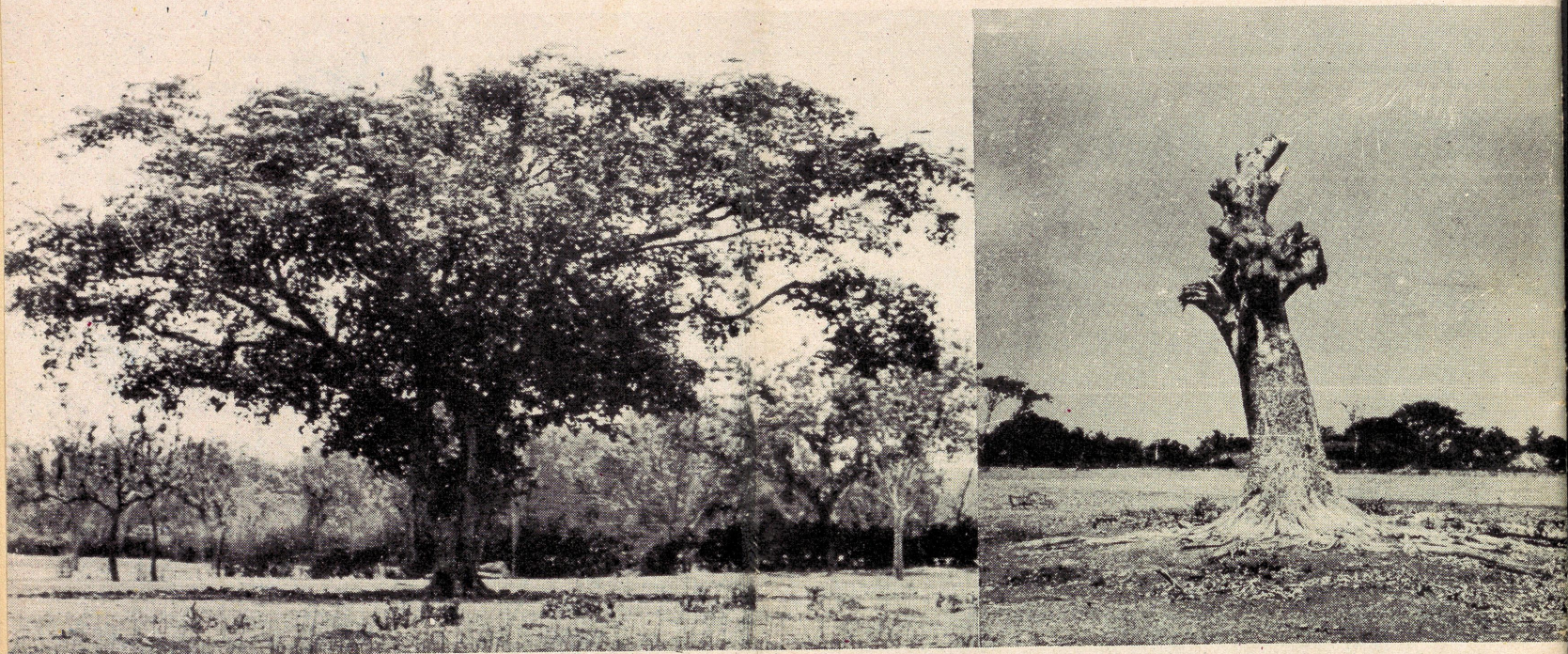
The pelicans suffered a major tragedy, when this prime tree much preferred by them for nesting, came under the axe due to a fatal confusion about its ownership.

kilometers away. It is here the pelicans have been coming to breed for centuries among the calm trees surrounding the thatched village hutments. The distress of witnessing a steady decline of this species over the years, from 185 nests in 1979 to 60 nests in 1991, was all too poignant.