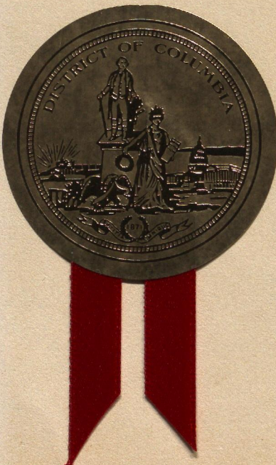
MARION BARRY, JR. MAYOR DISTRICT OF COLUMBIA

A handwritten signature in black ink that reads "Marion Barry, Jr." in a cursive style.