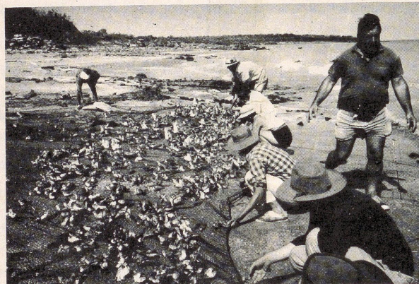
Waders being captured at Broome by means of a cannon-net for banding and leg-flagging

In Australia, Roebuck Bay has attracted much interest at both state and national levels. The Western Australian Department of Conservation and Land Management (CALM) has proposed a marine park here, which will include the important tidal flats, the beach, mangrove areas and the Roebuck Plain, a