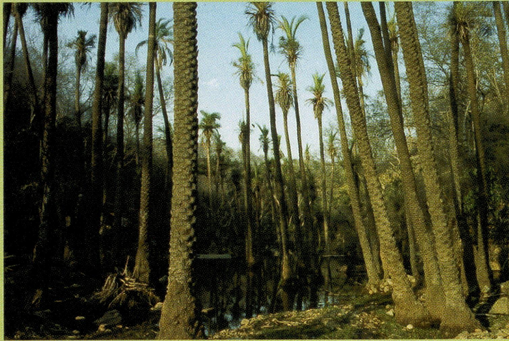
Date palm-dominated forests, occurring around perennial springs, are a critical element of landscape-level bird diversity in Sariska Tiger Reserve.