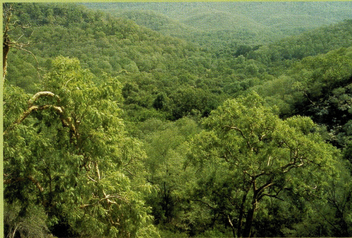
Dry deciduous forest, typical of the Aravallis, in green splendour after the rains.