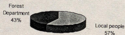
Participation in Entry Point activity